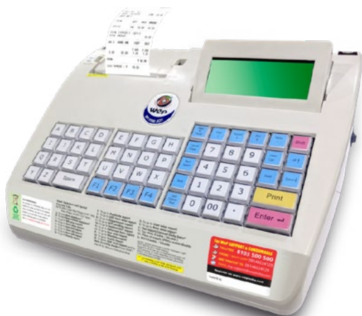
BP 1100 Joy- 2 Inch Printer in 59 Keys