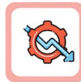
Low Per Page Cost