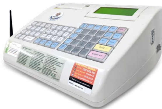
BP 2100 Emerge-WiFi Enabled Product