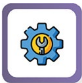
No AMC Charge