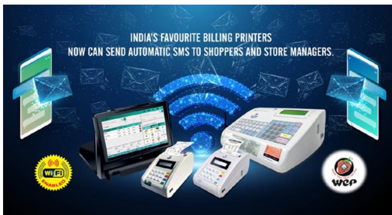
WiFi enabled Devices with SMS feature- JOYPOS, BP 2100 Emerge, BP Emerge 25T, BP Emerge Basic