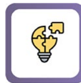
One Window Solution