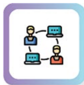
Remote Monitoring Tool