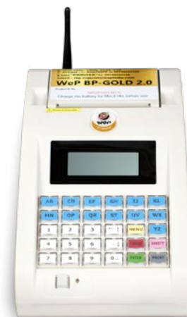
BP Gold 2.0- Segmented product for Jewellery Segment