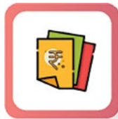
Pay for What You Print